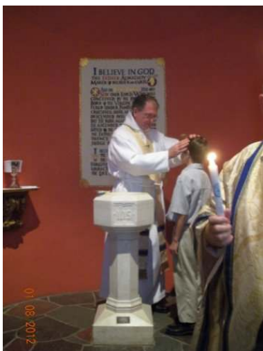
Baptisms on 8 January 2012, the Baptism of Our Lord.