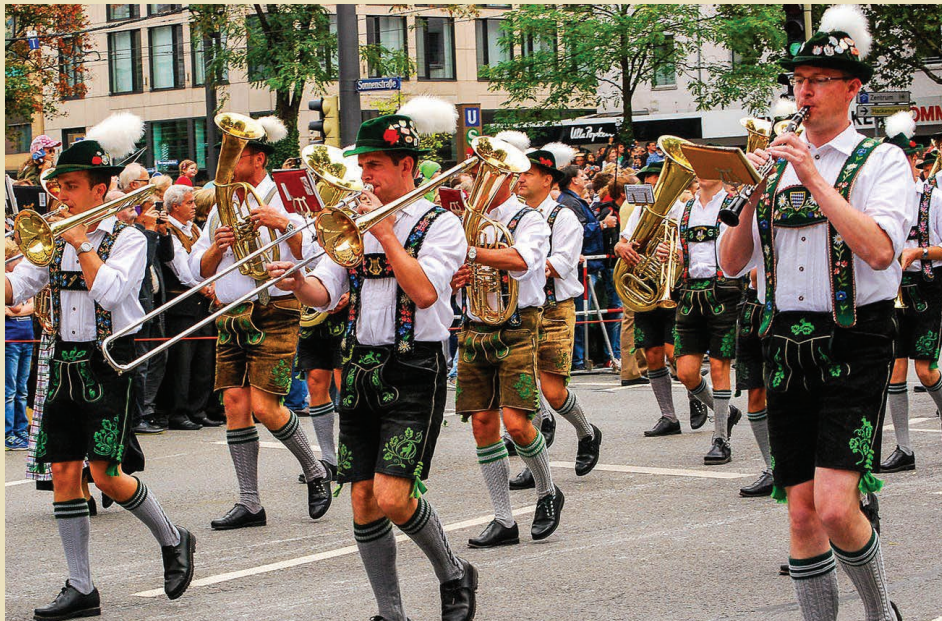
Oktoberfest Marching Band

Benefit for the American Guild of Organists Sarasota/Manatee Chapter