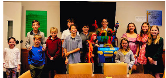
1st and 6th grades created their "Race Back" car

Members of the older classes begin to mentor their young counterparts, and the younger kiddos get to know "the big kids" in a brand new way. Community at its finest! Thank you to all who have fostered these relationships!