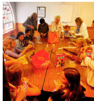
Kindergarten joined 5th grade to prep all the treats for Blessing of the Animals